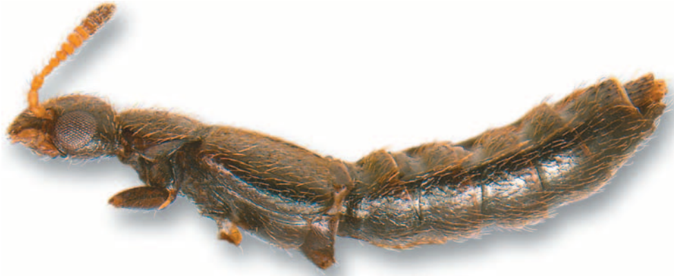
Fig. 2. Euvira micmac in lateral view, legs removed (length 2.0 mm).

(Figs. 3, 4; E. quadriceps , Fig. 11). It differs from the remaining species of Euvira by the genital features (for genital features of some Mexican species, see Ashe and Kistner 1989).