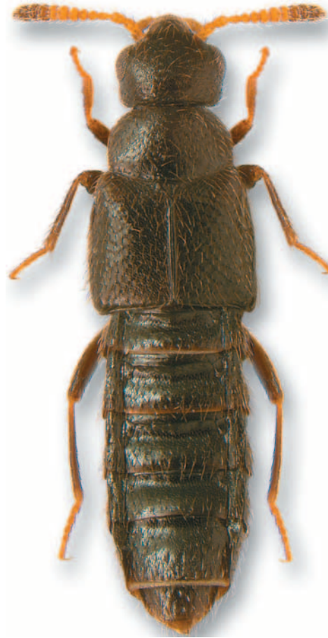
Fig. 1. Euvira micmac in dorsal view (length 2.0 mm).

however, the spelling “Micmac” was selected because apostrophes are not employed in scientific nomenclature. “Ponhook” is a Micmac word meaning “the first lake in a chain”.