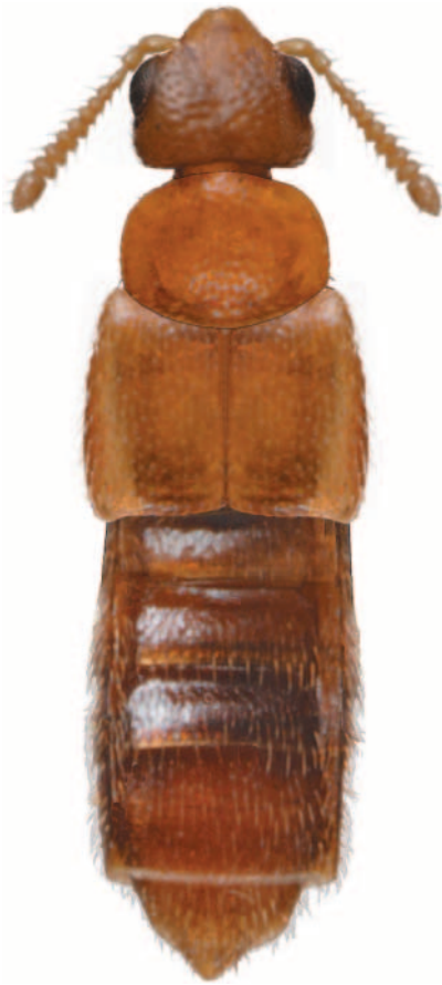
Fig. 11. Euvira quadriceps in dorsal view (length 1.0 mm).